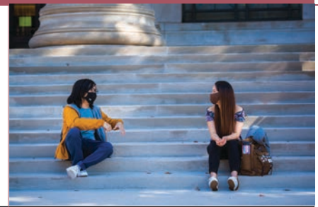
On Campus Fall 2020

in this issue we offer two of our Teach Talk features concerning online teaching, below and “ Teaching Under Covid: Losses Outweigh Gains ” (page 12); “ The Problem with Philanthropy ” (page 14); two pieces on STEM (pages 18 and 19); and “ MIT Volpe Construction Plan Will Damage Faculty Housing Initiative ” (page 21).