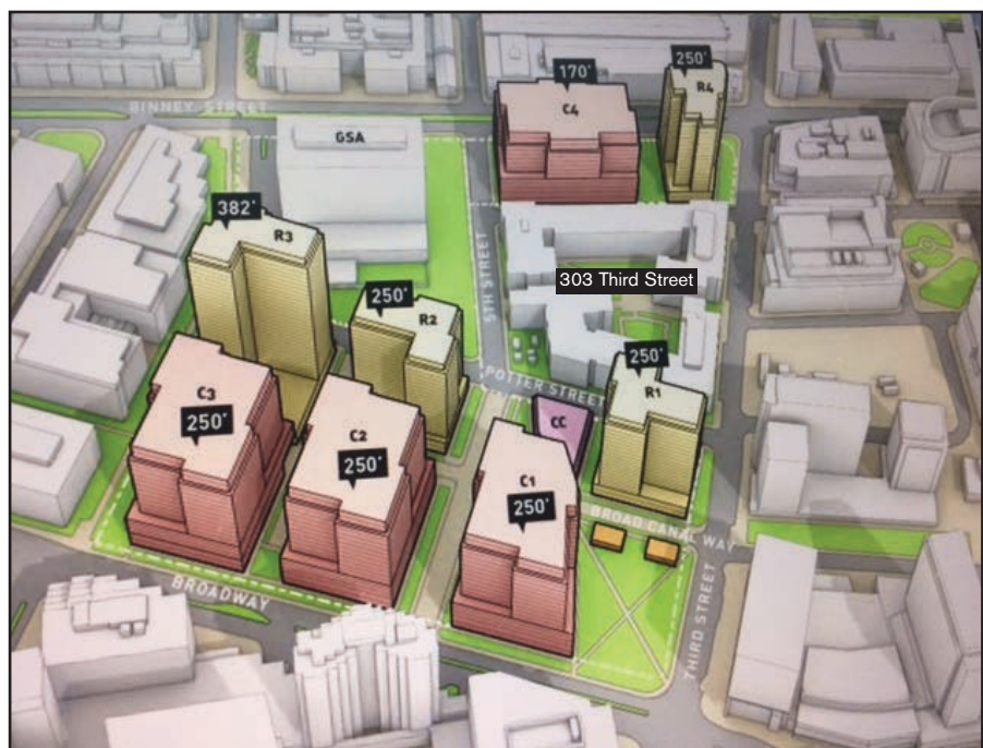
Current MITIMCo Proposal

damage to our homes which face the site. We expressed our preference for the least destructive of the plans and shortly thereafter, in 2017, MIT suspended further discussions about the planning of the remaining site, explaining that they were