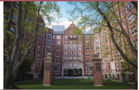
MIT Spring 2021