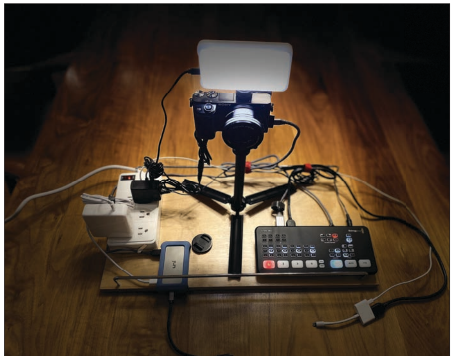
The No-Frills Derobotizer

You don’t need to settle for the robotic, pixelated version of yourself the pan-