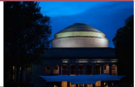
The MIT Dome